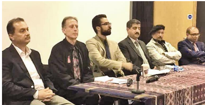
لندن: ورلڊ سنڌي ڪانگريس طرفان ڪرايل ڪانفرنس ۾ اڳواڻ استيعاب ٿي ويٺل آهن

The 28 th International Conference on Sindh was held at the University of Westminster, Harrow Campus, London, UK. Several dozen delegates attended the conference and traveled from different parts of the UK, EU, USA, Canada, India, Sindh, and Balochistan. A number of prominent speakers addressed topics such as CPEC, enforced disappearances, extrajudicial killings, misappropriation of Sindhi land, the degradation of Sindhi culture, and Pakistan's policies of oppressing Sindhi people, and the need to advance the Sindhi nation and preserve its culture. Several outlets covered the conference.