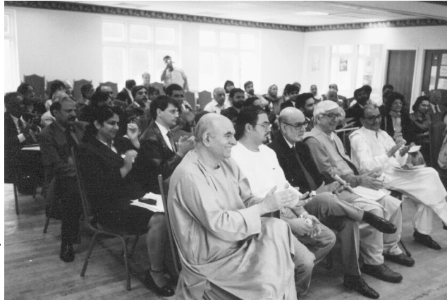
Activists and political leaders from all over the world attended the Sindh Conference in London in July 2000