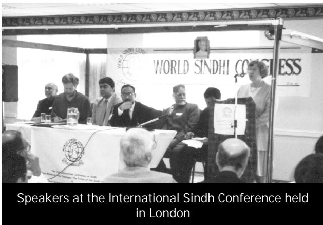
Speakers at the International Sindhi Conference held in London

Chicago, August 2000. A few thousands Sindhis from all over the world attended the 7th International Sindhi Sammelan held in Chicago during August 4th-6th. This event was organized by The Alliance of Sindhi Association of Americas, Inc. (ASA). This three-day program consists of sessions on Sindhi nation, culture, issues pertaining to senior citizens, inter-racial/inter-community marriages, community support etc. It also included special programs for women, and youth members. Sindhi music evening was also arranged. For more information please visit http://www.sindhisammelan.com .