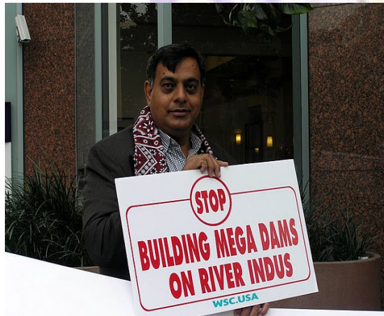
A Sindhi in Los Angeles protesting against the damming of River Indus. USA paid 20 B$ aid to Pakistan from 2001-09 despite Pakistan's continued human rights violations and ambiguity towards the international terrorism.