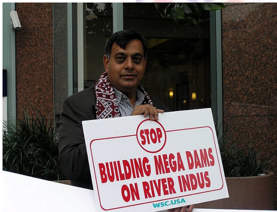
A Sindhi in Los Angeles protesting against the damming of River Indus. USA paid 20 B$ aid to Pakistan from 2001-09 despite Pakistan's continued human rights violations and ambiguity towards the international terrorism.